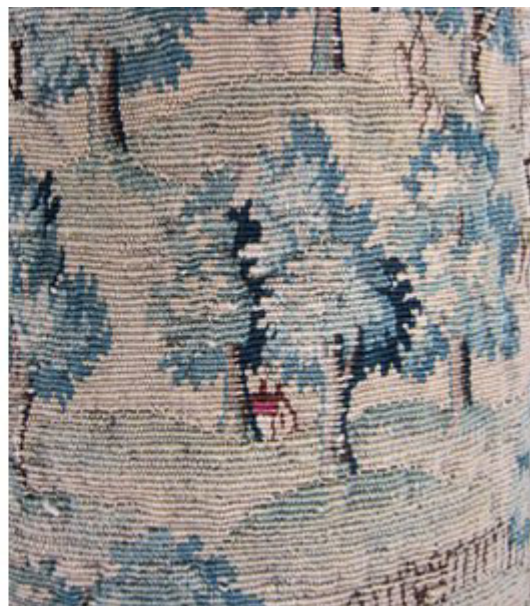
Left: Bear with blue claws Right: Cottage in the Forest of Arden

We have made many new and fascinating discoveries during the last year, which has helped to build our knowledge of this wonderful object and its history.