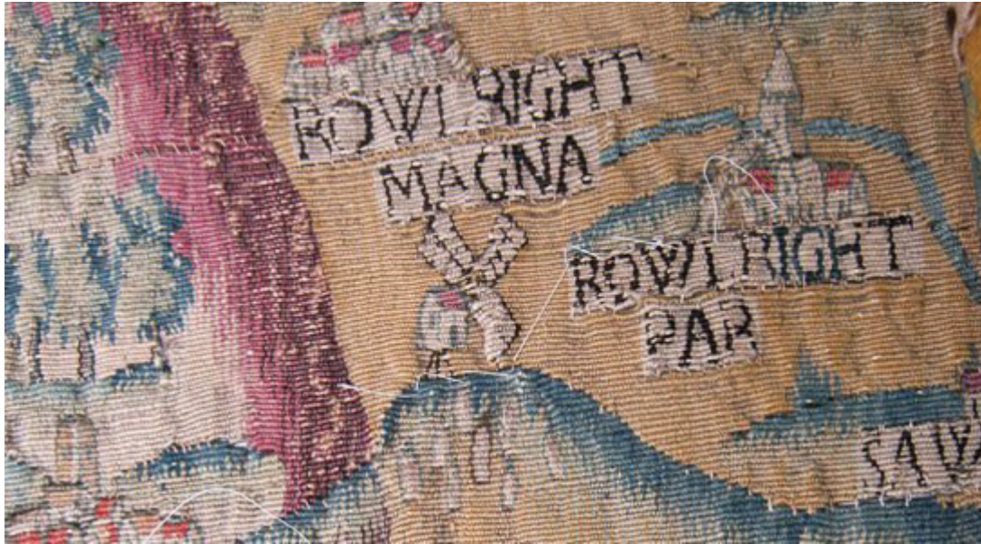
Rollright Stones – just below the windmill

We've now noticed that this bear's claws are blue and that there are many tiny cottages hidden in the Forest of Arden.