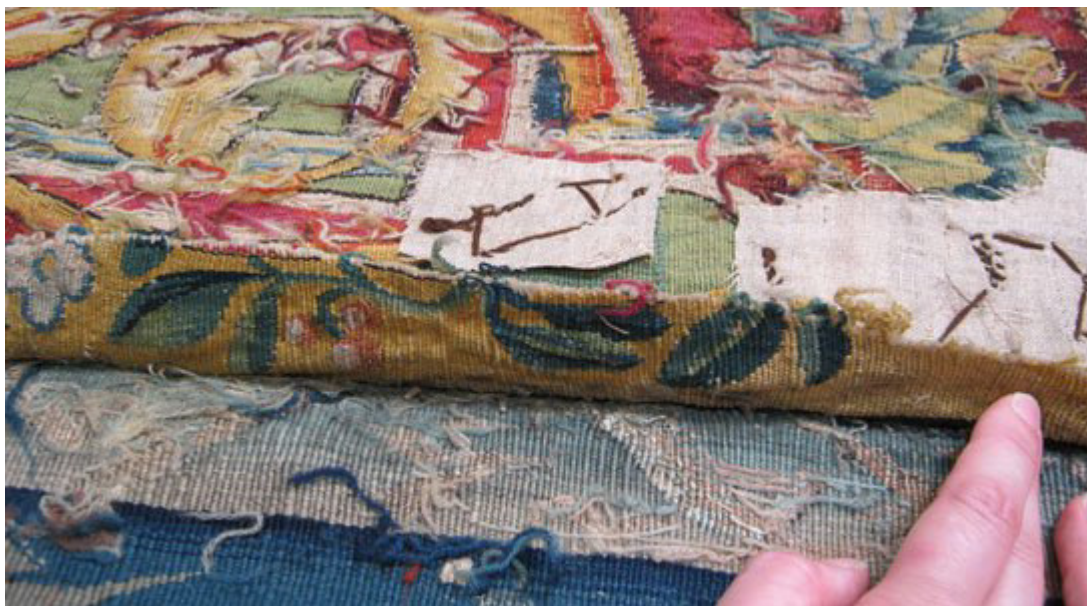
Original tapestry border

The tapestry's border was replaced in the 17th century. Removing the lining revealed fragments of the original Elizabethan border – much more lively and colourful than the later replacement.