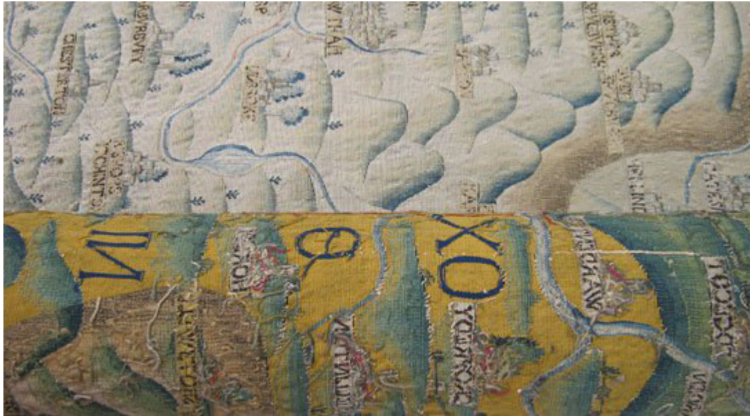
Original green and yellow on reverse of tapestry, contrasted with faded colour on the front

The tapestry's border was replaced in the 17th century. Removing the lining revealed fragments of the original Elizabethan border – much more lively and colourful than the later replacement.