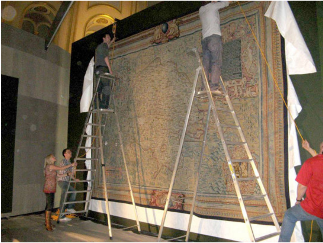
Raising the tapestry into place with pulleys