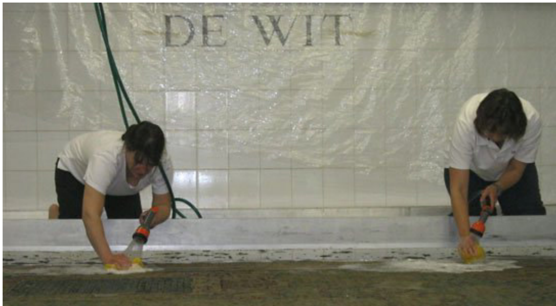
Gently sponging the tapestry during wet-cleaning

Wet-cleaning didn't restore the original bright colour, lost through light damage, but it did make tiny details easier to see.